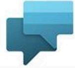
Power Virtual Agents

Microsoft Power Platform allows you to adapt to a changing business environment quickly - analyse data, build solutions, automate processes. It bridges the gap between the data you already have and the solution you need to analyse and visualise the information.