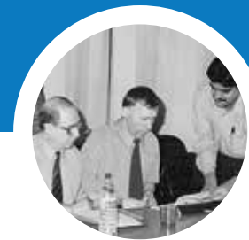
On Site Project Team