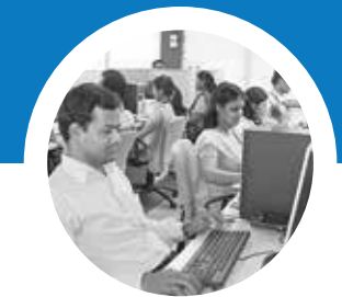
Offshore Development Centre